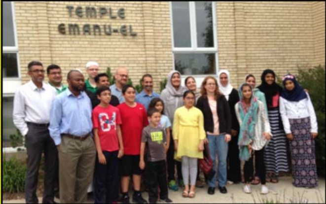
Members of the Islamic Society of Milwaukee – Brookfield visited CEEW on Sept. 27 th , 2015.