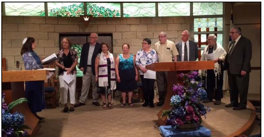
Sandy Villa photo

The professionals agreed that if we had to prioritize our slender resources, the single most effective action we could take would be to have an armed, uniformed law enforcement officer on duty during religious school sessions.